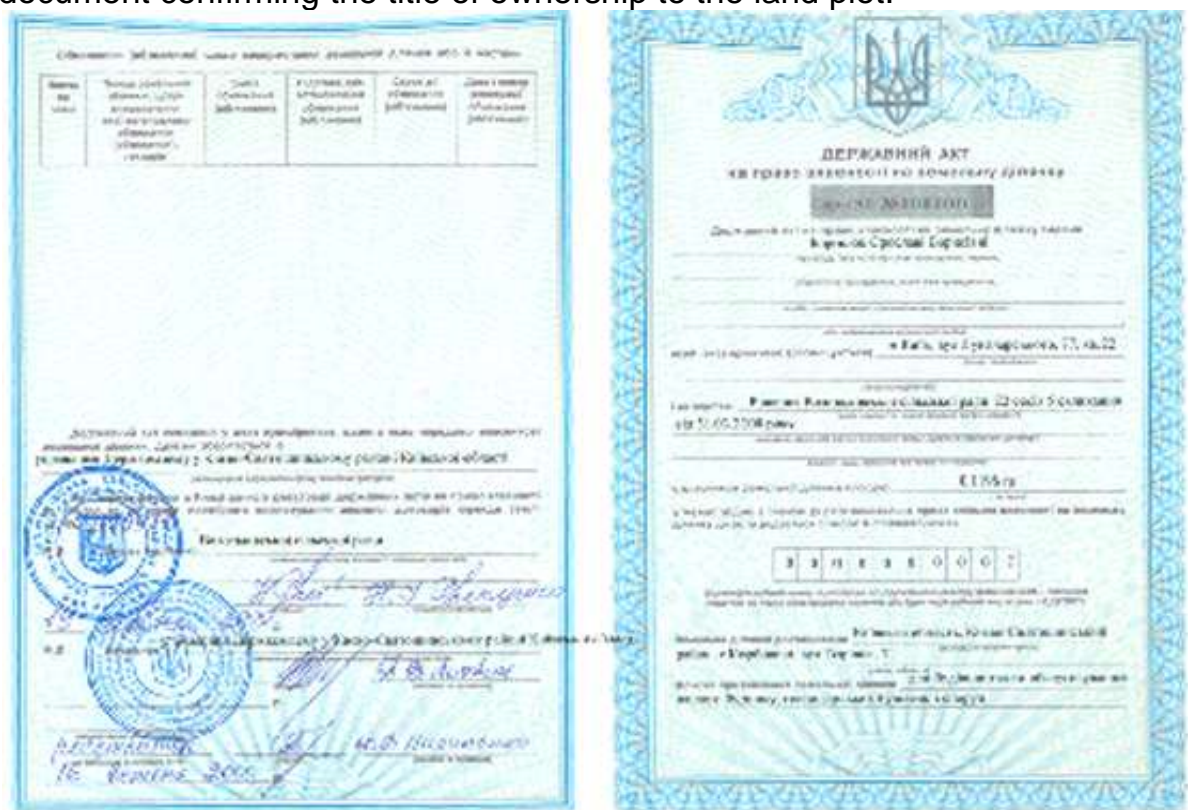
Fig. 3. State Act on Title of Ownership to the Land Plot in Ukraine

In practice the State Act is like a passport for the land, which strictly defines borders of a land plot and gives the right to a person to use, lease, bequeath and sell the land plot in the future (after the Moratorium on selling agricultural lands will be cancelled) (Figure 3). State Act is recognized as the final document confirming the title of ownership to the land plot.