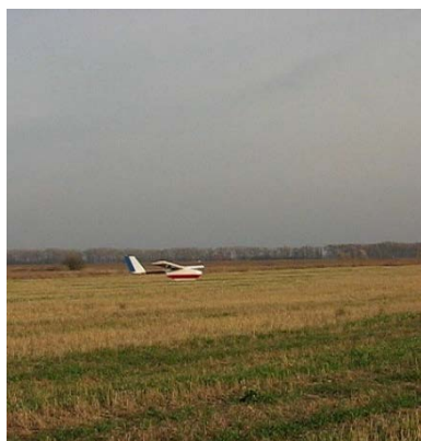
Fig. 3. Nonpilot flying device "A - 1".

This technology uses in a continuous, or local resettlement Trichogramma. For continuous settlement Trichogramma used unmanned system, which set a given width of the treated area, altitude, area of spread and set the standard. If necessary, local resettlement Trichogramma applies operative control variable application rate of technological material using equipment to measure the intensity of plant