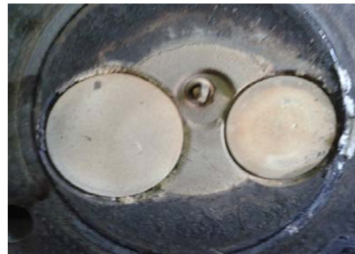
Fig. 5. Application of purified biogas as the fuel – no destruction and corrosion effects are visible

Effects of direct use of crude biogas is presented in Fig. 6.