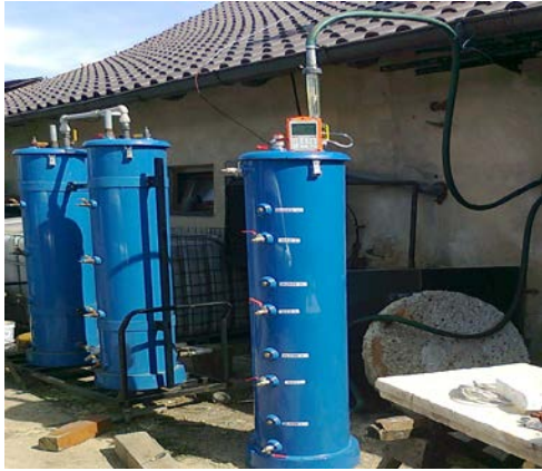
Fig. 3. Research stand in a small-scale agricultural biogas plant