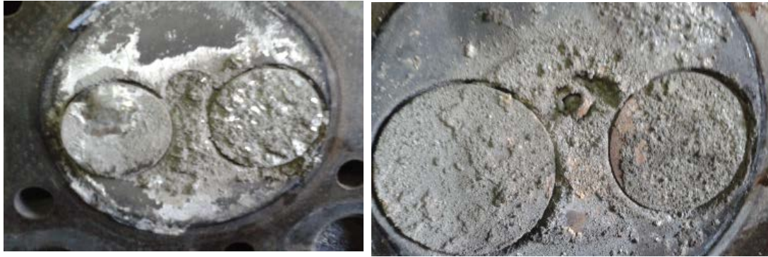
Fig. 6. Effects of direct use of crude biogas (no purification)

Chemical analysis of deposits in combustion chamber of the engine fed with mine gas (coal bed methane) of chemical composition similar to agricultural biogas is presented in Table 3.