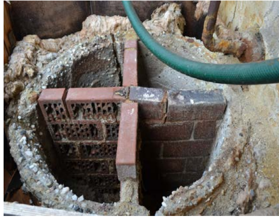
Fig. 4. Destructed elements of concrete exhaust gases silencer – corrosion effect of acid gases from the engine

During combustion of crude biogas corrosion of concrete elements was observed. Acid sulphur and nitrogen oxides strongly destroyed concrete construction of exhaust gases silencer (Fig. 4). Contrary, combustion of correctly purified biogas is not connected with formation of significant amounts of deposit inside the engine. The internal combustion engine after 30,000 h of continuous work as an agricultural biogas plant's element is presented in Fig. 5.