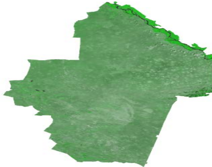
Fig. 2. Snapshot territory on May 12

Pattern Recognition includes a number of stages: