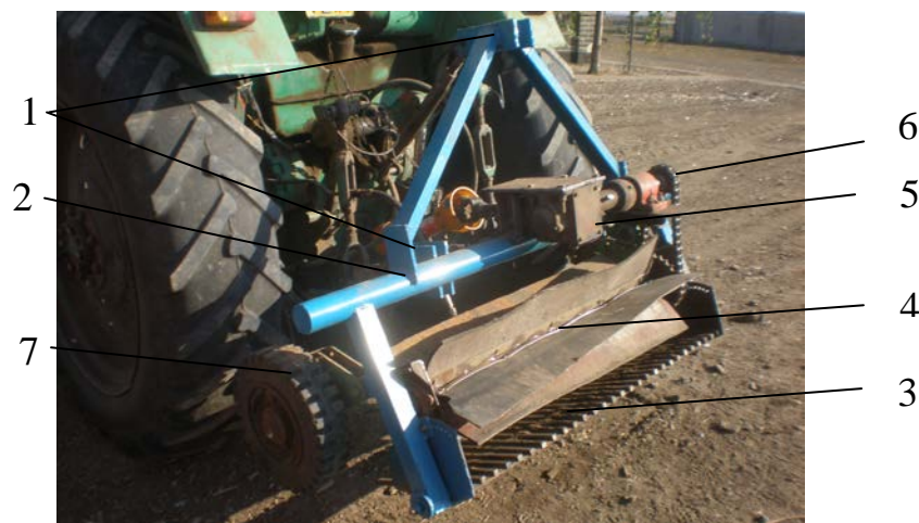
Fig. 3. Experimental setup: 1 - attached device; 2 - frame; 3 - digging working bodies (set of bits); 4 - bitters; 5 - gear; 6 - drive; 7 - support wheel.

To study the process of digging onions in the wildebeest "UkrNDIPVT named Leonid burned" developed and produced experimental setup (Fig. 3). The experimental setup is: attaching 1, 2 with a special frame set therein dolotopodibnymy working bodies 3, 4 bitters, angular gear 5 drive bitters 6 and 7 supporting wheels.