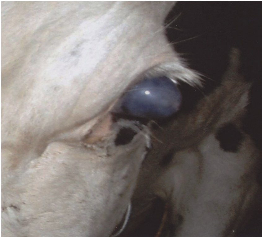
Figure 3. Eyeball baking in conjunction with glaucoma.