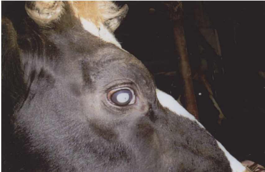
Figure 2. Posterior synechia and cataracts