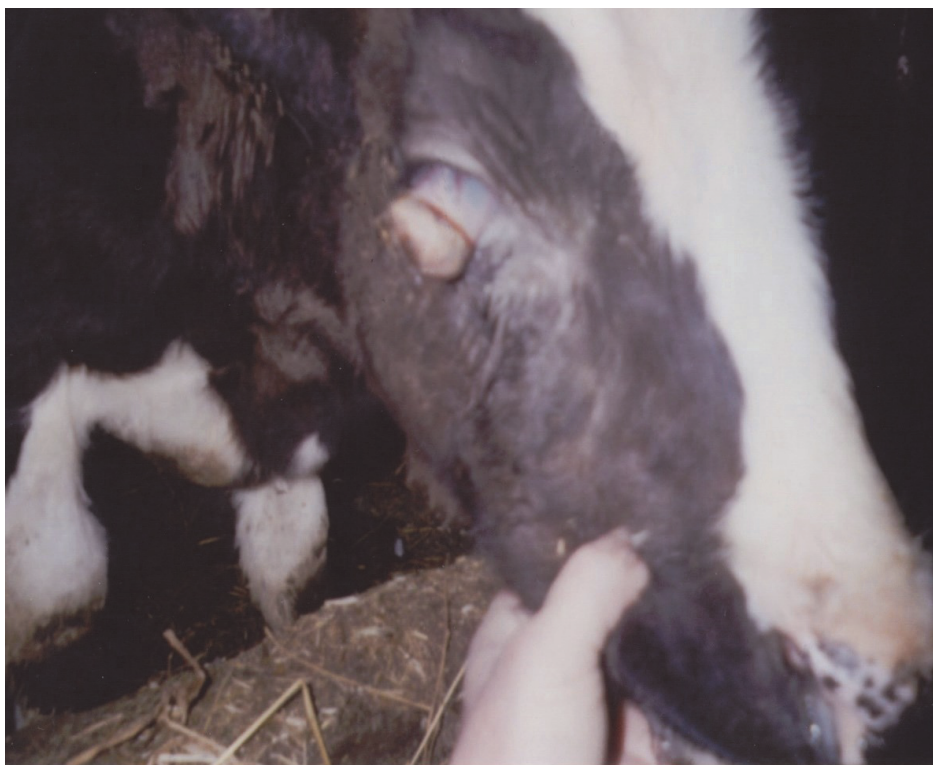
Figure 4. The rupture of the eyeball with the loss of the lens

Fibrinous uveitis of streptococcal etiology in cattle is characterized by involvement in the inflammatory process mainly of the iris and ciliary body.