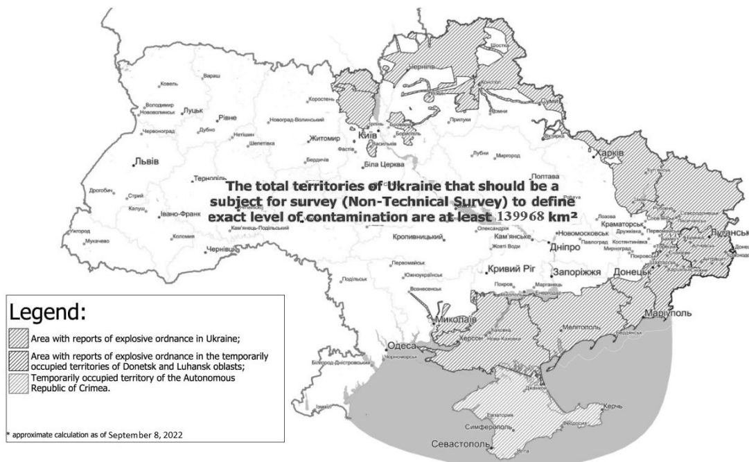
Fig. 2. Potentially dangerous territories of Ukraine that may contain explosive objects as of September 8, 2022.

Both on the frontline and in occupied (or formerly occupied) territories, agricultural land is at high risk of mine con-