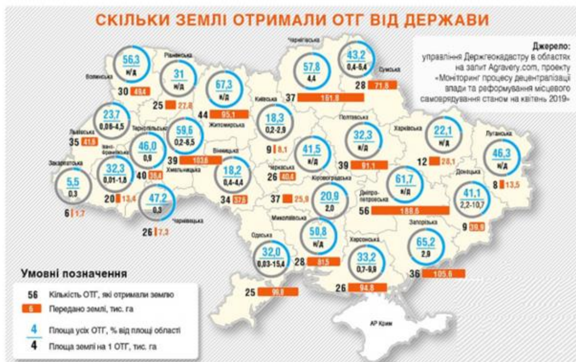
Fig.2 Status of transfer / receipt of agricultural land OTG as of April 2019

As of March 4, 2020, the State Geocadastre and its territorial bodies transferred to the established OTG in the ownership or use of state-owned agricultural land in the amount of 1.5 million hectares (Fig.2) [1].