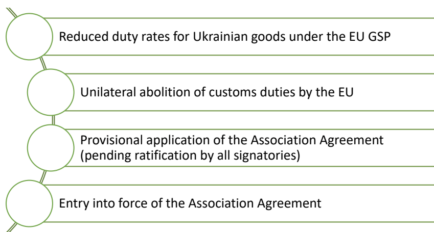
Fig. 1. Stages of implementation of the free trade area (FTA) with the EU

Thus, 11 groups of goods under quotas were quickly exhausted. The main drivers of accelerating the exhaustion of quotas for exports of domestic products to the EU were such groups of goods as: